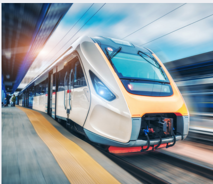
Rolling Stock MRO